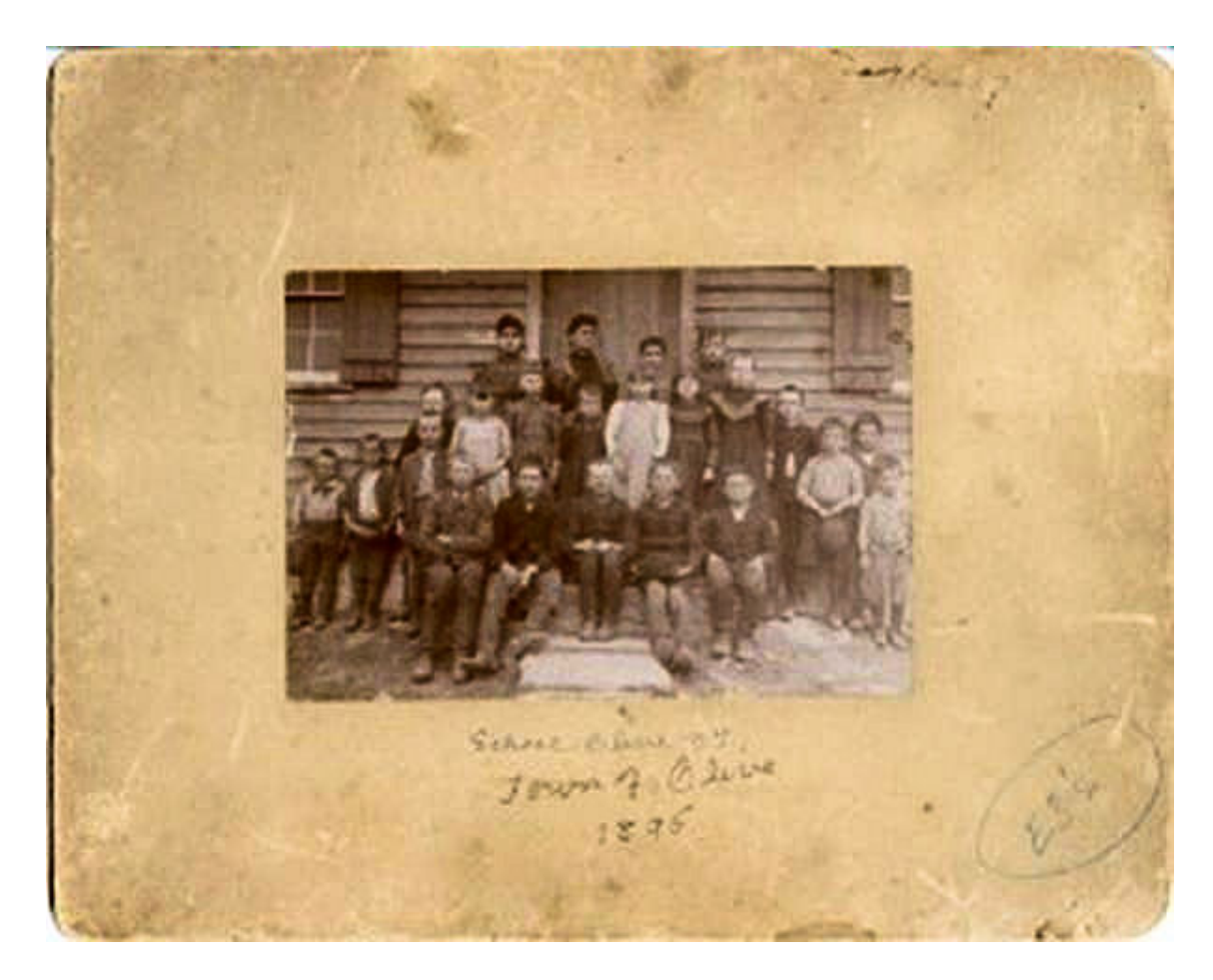
What it took to get an 8th grade education in 1895...

Remember when grandparents and great-grandparents stated that they only had an 8th grade education? Could any of us have passed the 8th grade in 1895? This is the eighth-grade final exam from 1895 in Salina, Kansas, USA It was taken from the original document on file at the Smokey Valley Genealogical Society and Library in Salina, and reprinted by the Salina Journal.