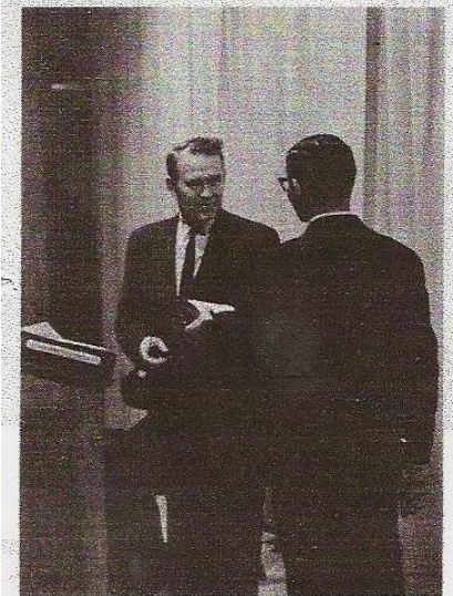
SENATOR BURDICK, PATRICK CURRAN "Old Glory"

In his speech the Senator impressed upon the students the importance of continuing one's education through life. He also emphasized the need for citizens to participate on two levels, the selection of candidates and the final election of officials.